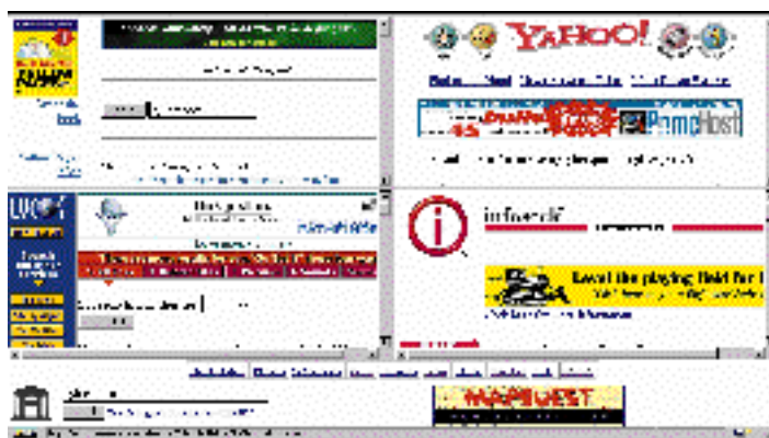
Figure 1. The SuperSeek meta search engine. Ten search engines are exploited in the meta-level search. SuperSeek uses Netscape frames to achieve the multi-paning interface for quick information uptake.

Search engines as they now exist represent a primitive, first cut at efficient information access on the Internet. But the reality is